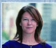
Rosenberg & Estis, P.C.