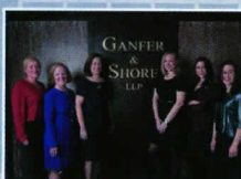
Ganfer & Shore, LLP

A Special Advertising Section presented by