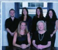
Burger & Green, LLP