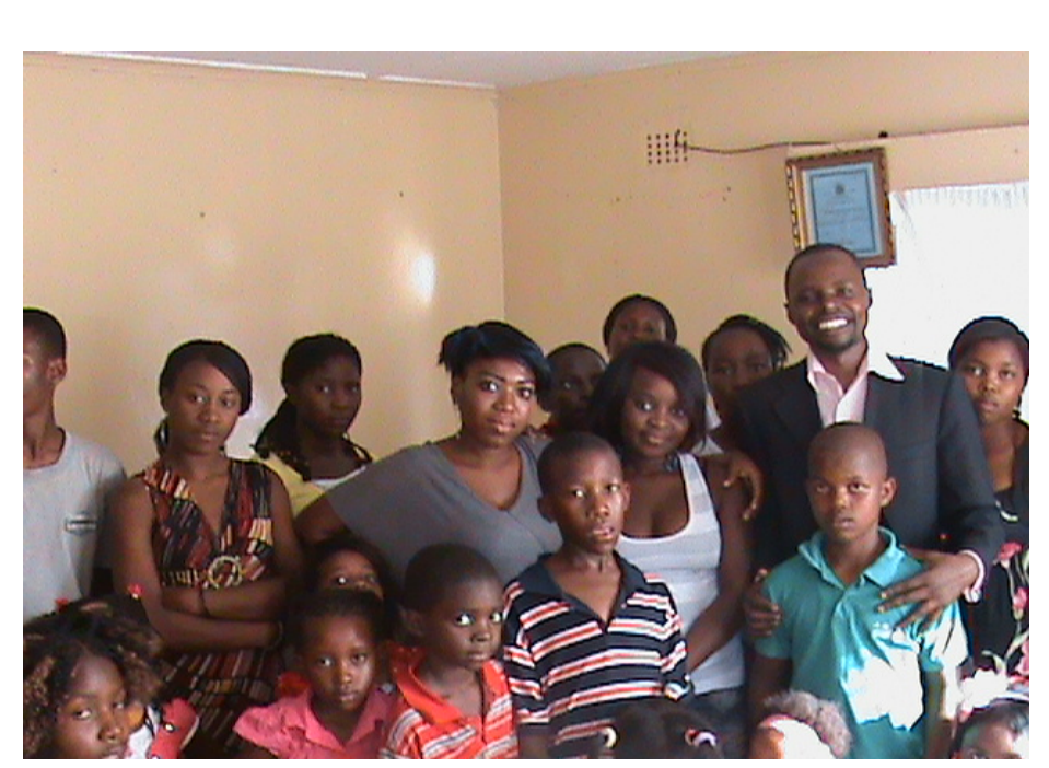
IFFAMPAC Africa Representative with Children at the luncheon

The IFFAMPAC Luncheon symbolizes the upholding of unity, family values, reconciliation, love and togetherness among families, so as to help set stage for the 2012 programs.