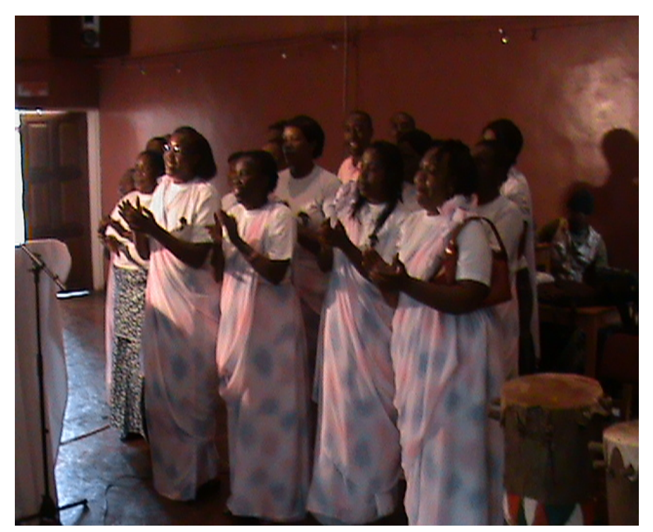
Women singing in local African Language

The family association Great Lakes Women Refugees Association Zambia GRWAZ lead women and girls the commemoration of internationals women's day.