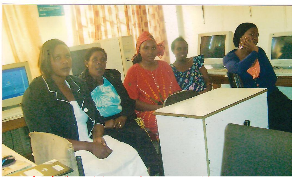
Women from family associations attending Computer training course

The program hopes to achieve the following goals: